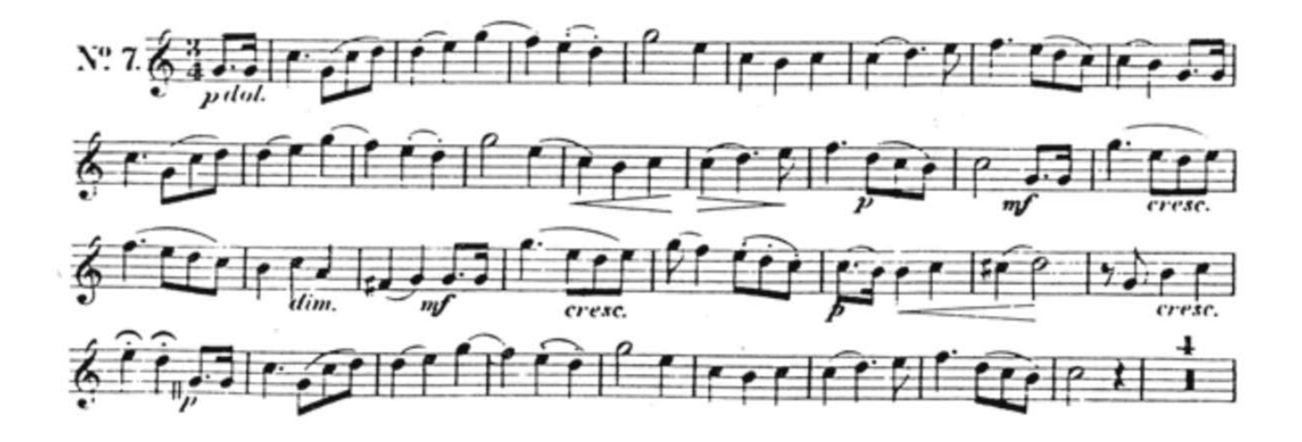
Trumpet Bizet, Carmen Suite No. 1, Prelude, All

Mendelssohn, Midsummer Night's Dream, Nocturne, mm. 1-34