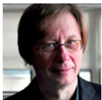
Georg Friedrich Haas, Distinguished Composer In Residence 2020-21