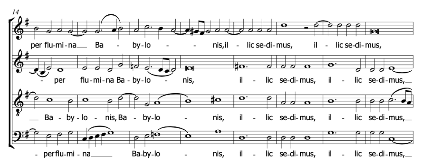
Copyright © 2015 by CPDL. This edition can be fully distributed, duplicated, performed, and recorded.