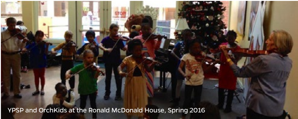
YPSP and OrchKids at the Ronald McDonald House, Spring 2016

This year's YPSP and Playing Partners (OrchKids) combined outreach concert will be on Friday, May 12 at 5:00 pm at the Ronald McDonald House in West Baltimore. More details will be sent by email and we are looking forward to having many of our students participate.