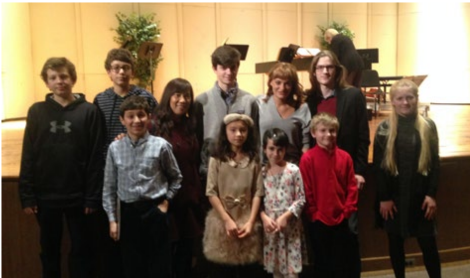
On February 12 several YPSP and Performance Academy for Strings students went to a dress rehearsal and concert at Shriver Hall to hear the Venice Baroque Orchestra and violin soloist Nicola Benedetti play Vivaldi's The Four Seasons .